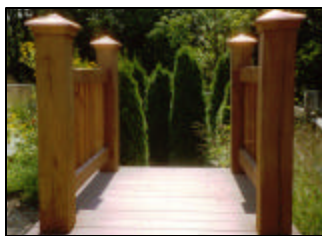
The lookout bridge gives visitors an overview of the Children’s Garden.

Maps of the Children’s Garden are available at the entrance gate and illustrate the numerous attractions and points of interest in the garden. Visitors of all ages have enjoyed smelling and touching the plants in the sensory raised beds, where the scents of pineapple sage, lemon thyme, and lavender fill the air on a late summer day.