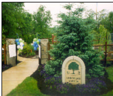
The gates of the Children’s Garden are open to visitors of all ages.

Whether you are a day-care provider or parent looking for a fun, educational adventure for your children; a family enjoying time together outside; or a home gardener looking