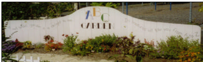
Can you find any flowers or plants missing from the ABC Garden? Come visit the Children’ Garden to see if you can find them.